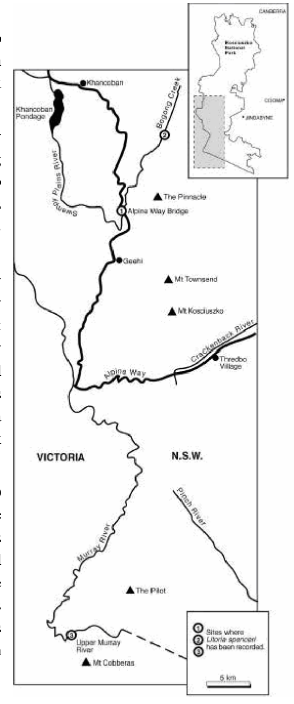
Figure 1: Sites where Litoria spenceri have been recorded.

Another population in the upper Murray River (site 3) was first detected in 1996 by Hunter & Gillespie (1999). Only one sub-adult frog was ever found at this location and repeat surveys of the same area have failed to locate this or other individuals (Hunter & Gillespie 1999, NSW NPWS 2001). All the evidence suggests that the density and size of this population was extremely low, and that it may now well be extinct in the wild (expert advice, 2008).