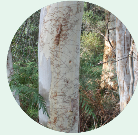
Quorrobolong Scribbly Gum Woodland NSW status: Endangered National status: Not listed