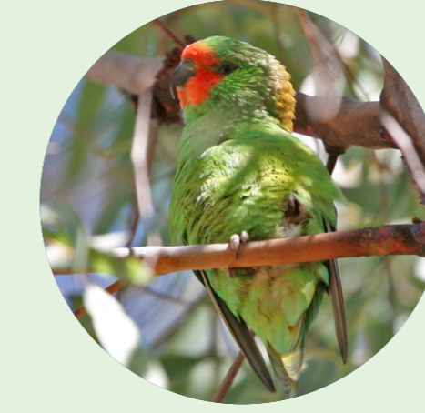
Little lorikeet Glossopsitta pusilla NSW status: Vulnerable National status: Not listed