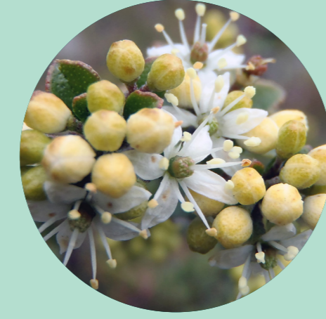
Broken Back phebalium Leionema lamprophyllum subsp. fractum NSW status: Critically Endangered National status: Critically Endangered