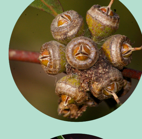
Earp's dirty gum Eucalyptus parramattensis subsp. decadens NSW status: Vulnerable National status: Vulnerable