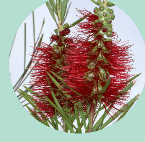
Netted bottle brush Callistemon linearifolius NSW status: Vulnerable National status: Not listed