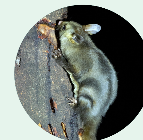
Yellow-bellied glider Petaurus australis NSW status: Endangered National status: Not listed