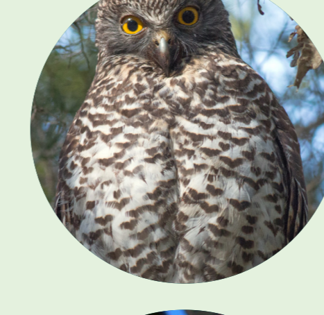
Powerful owl Ninox strenua NSW status: Vulnerable National status: Not listed