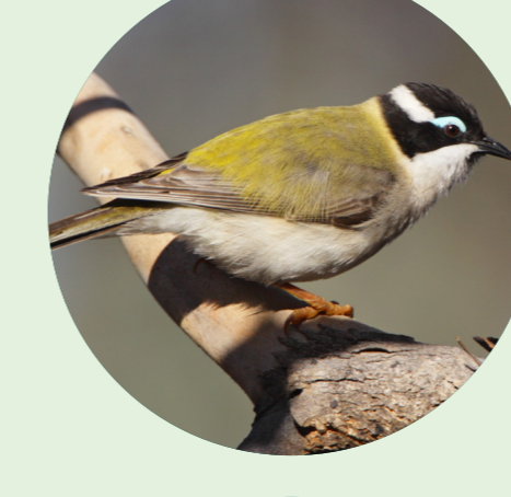
Black-chinned honeyeater Melithreptus gularis gularis NSW status: Vulnerable National status: Not listed