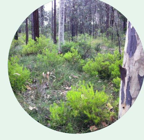
Lower Hunter Spotted Gum Ironbark Forest NSW status: Endangered National status: Not listed