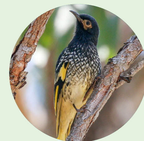
Regent honeyeater Anthochaera phrygia NSW status: Critically Endangered National status: Critically Endangered