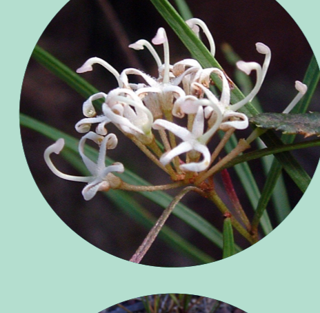
Small-flower grevillea Grevillea parviflora subsp. parviflora NSW status: Vulnerable National status: Vulnerable