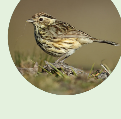
Speckled warbler Chthonicola sagittata NSW status: Vulnerable National status: Not listed