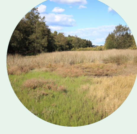
Coastal Saltmarsh NSW status: Endangered National status: Not listed