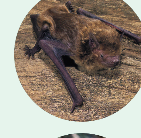
Greater broad-nosed bat Scoteanax rueppellii NSW status: Vulnerable National status: Not listed