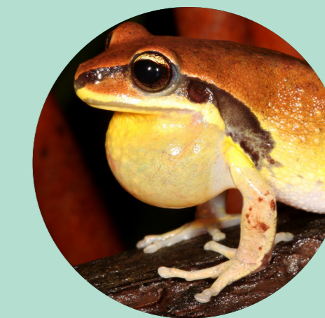
Green-thighed frog Litoria brevipalmata NSW status: Vulnerable National status: Not listed