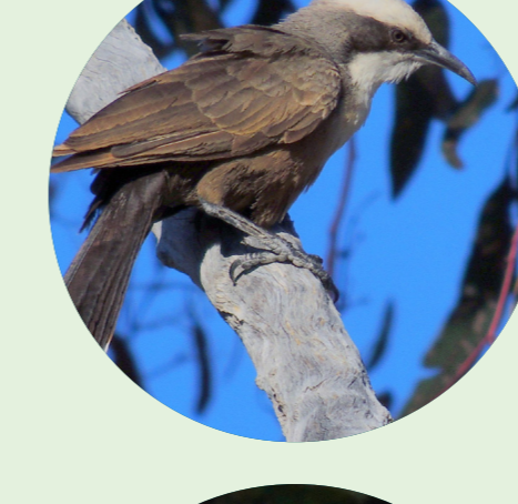
Grey-crowned babbler Pomatostomus temporalis temporalis NSW status: Vulnerable National status: Not listed