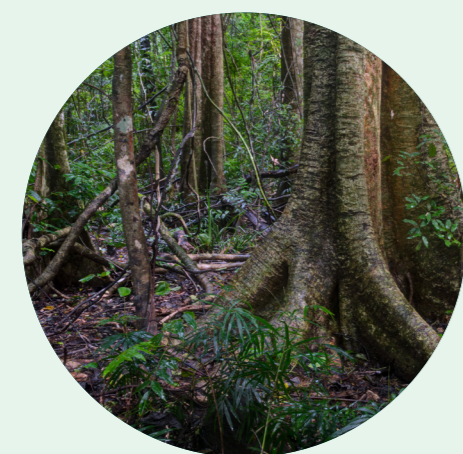
Lowland Rainforest NSW status: Endangered National status: Not listed