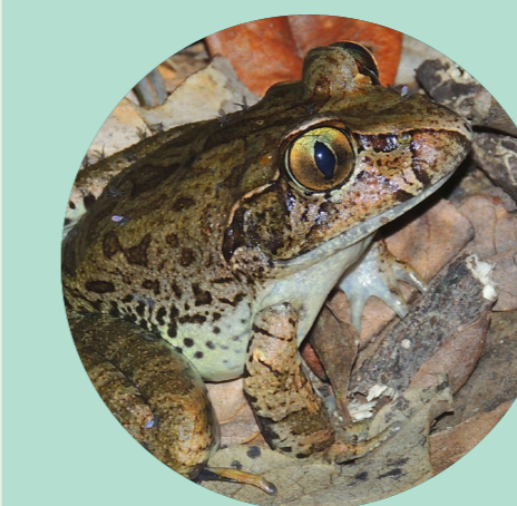
Giant barred frog Mixophes iteratus NSW status: Endangered National status: Endangered