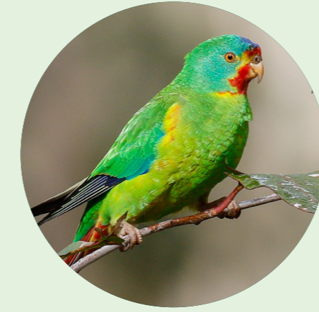
Swift parrot Lathamus discolor NSW status: Endangered National status: Critically Endangered