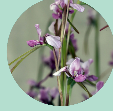
Sand doubletail Diuris arenaria NSW status: Endangered National status: Not listed