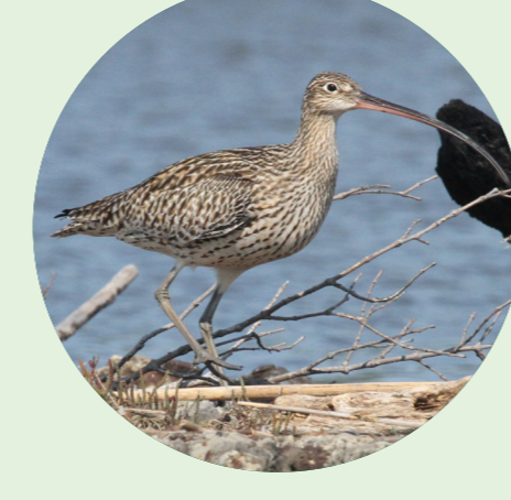
Eastern curlew Numenius madagascariensis NSW status: Not listed National status: Critically Endangered