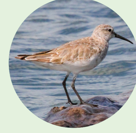
Curlew sandpiper Calidris ferruginea NSW status: Endangered National status: Critically Endangered