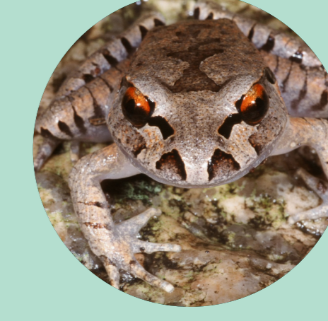
Stuttering frog Mixophyes balbus NSW status: Endangered National status: Vulnerable