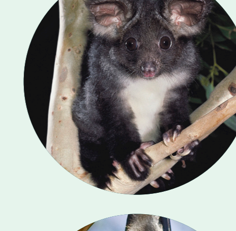
Greater glider Petauroides volans NSW status: Vulnerable National status: Endangered