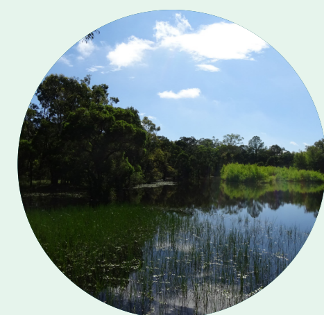
Freshwater Wetlands on Coastal Floodplains NSW status: Endangered National status: Not listed