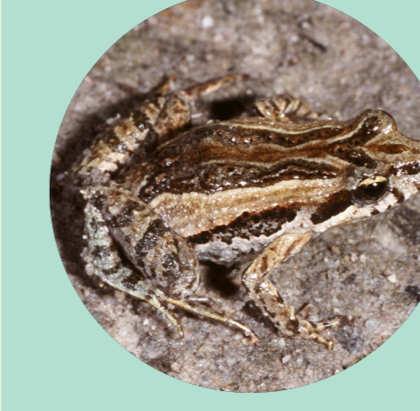
Wallum froglet Crinia tinnula NSW status: Vulnerable National status: Not listed