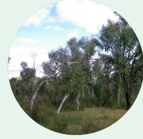
Kurri Sand Swamp Woodland NSW status: Endangered National status: Not listed