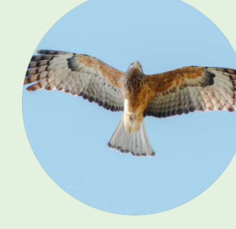
Square-tailed kite Lophoictinia isura NSW status: Not listed National status: Not listed