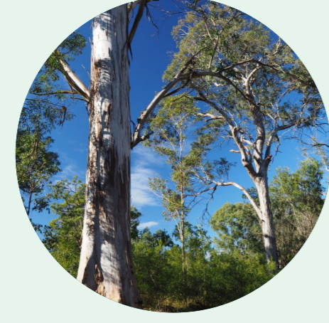
River-Flat Eucalypt Forest on Coastal Floodplains NSW status: Endangered National status: Not listed