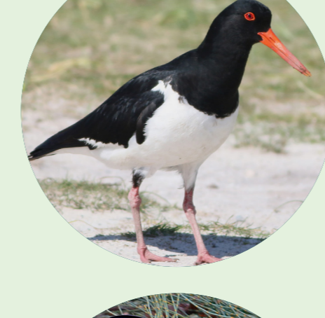
Pied oystercatcher Haematopus longirostris NSW status: Endangered National status: Not listed