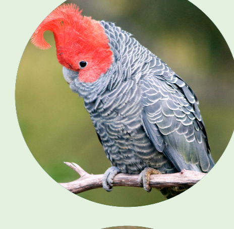
Gang-gang cockatoo Callocephalon fimbriatum NSW status: Vulnerable National status: Endangered