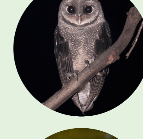
Sooty owl Tyto tenebricosa NSW status: Vulnerable National status: Not listed