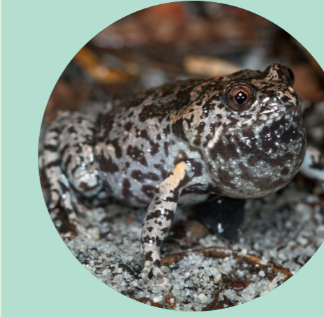
Mahony's toadlet Uperoleia mahonyi NSW status: Endangered National status: Not listed