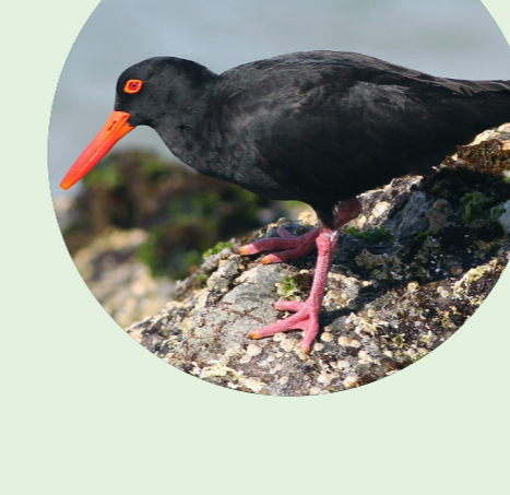
Sooty oystercatcher Haematopus fuliginosus NSW status: Vulnerable National status: Not listed