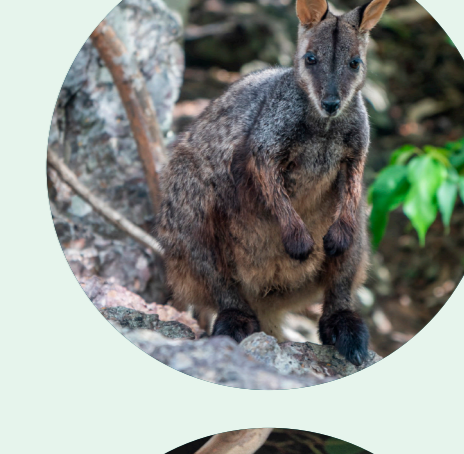
Brush-tailed rock-wallaby Petrogale penicillata NSW status: Endangered National status: Vulnerable