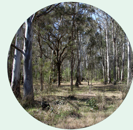
Hunter Lowland Redgum Forest NSW status: Endangered National status: Not listed