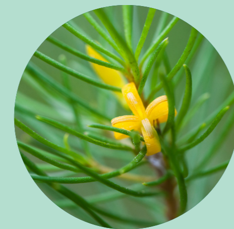
North Rothbury persoonia Persoonia pauciflora NSW status: Critically Endangered National status: Critically Endangered