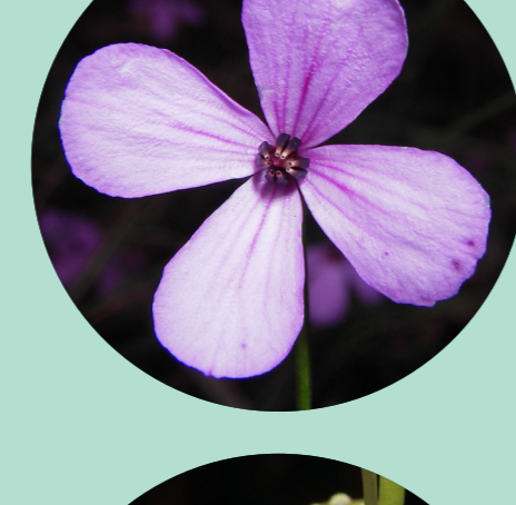
Black-eyed Susan Tetratheca juncea NSW status: Vulnerable National status: Vulnerable