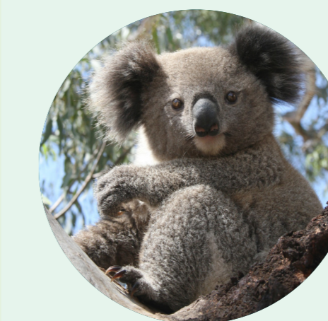
Koala Phascolarctos cinereus NSW status: Endangered National status: Endangered