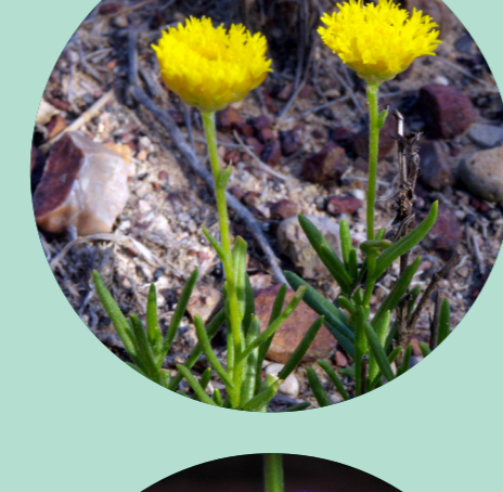
Heath wrinklewort Rutidosia heterogama NSW status: Vulnerable National status: Vulnerable