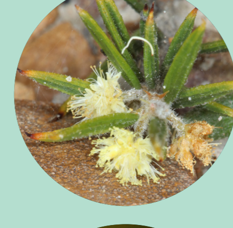
Bynoe's wattle Acacia bynoeana NSW status: Endangered National status: Vulnerable