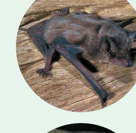
Eastern freetail-bat Mormopterus norfolkensis NSW status: Vulnerable National status: Not listed