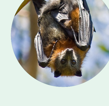
Grey-headed flying-fox Pteropus poliocephalus NSW status: Vulnerable National status: Vulnerable