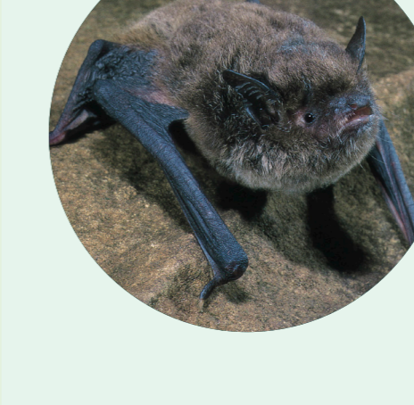
Southern myotis Myotis macropus NSW status: Vulnerable National status: Not listed