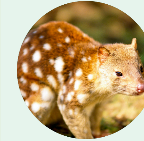
Spotted-tailed quoll Dasyurus maculatus NSW status: Vulnerable National status: Endangered