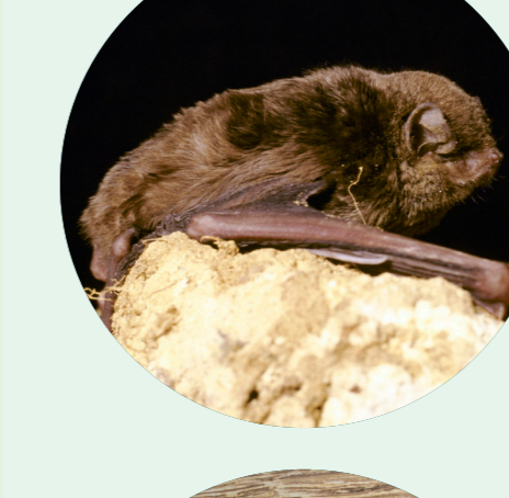
Eastern bentwing-bat Miniopterus schreibersii NSW status: Vulnerable National status: Not listed