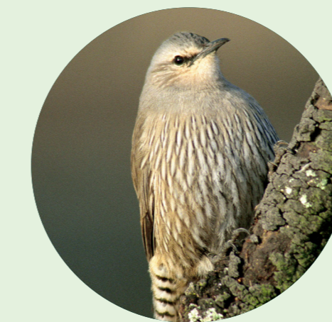
Brown treecreeper Climacteris picumnus victoriae NSW status: Vulnerable National status: Not listed