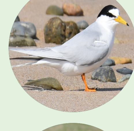
Little tern Sterna albifrons NSW status: Endangered National status: Not listed