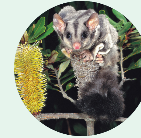
Squirrel glider Petaurus norfolkensis NSW status: Vulnerable National status: Not listed