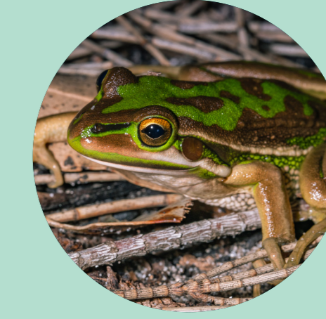
Green and golden bell frog Litoria aurea NSW status: Endangered National status: Vulnerable