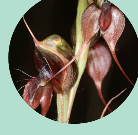
Tall rustyhood Pterostylis chaetophora NSW status: Vulnerable National status: Not listed