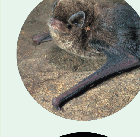
Little bentwing-bat Miniopterus australis NSW status: Vulnerable National status: Not listed