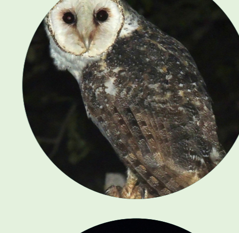
Masked owl Tyto novaehollandiae NSW status: Vulnerable National status: Not listed