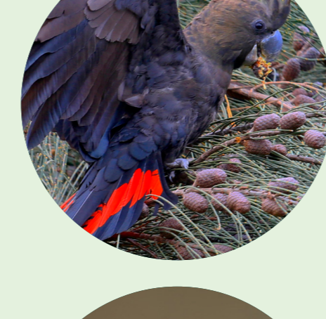
Glossy black-cockatoo Calyptorhynchus lathamii NSW status: Vulnerable National status: Not listed