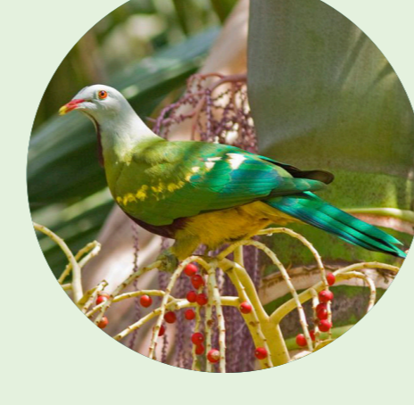
Wompoo fruit-dove Ptilinopus magnificus NSW status: Vulnerable National status: Not listed