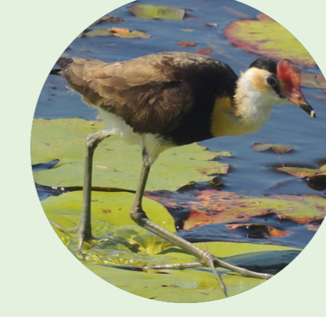
Comb-crested jacana Irediparra gallinacea NSW status: Vulnerable National status: Not listed