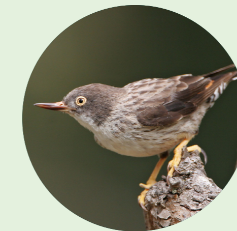
Varied sittella Daphoenositta chrysoptera NSW status: Vulnerable National status: Not listed