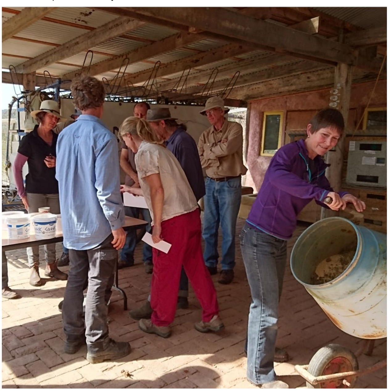
Photo 3 Volunteers at the Crossing Education Centre on the south coast making seed balls for koala habitat.

National Threatened Species Day highlights the past and how we can protect threatened species now and into the future, while also celebrating species success stories and ongoing threatened species recovery work.