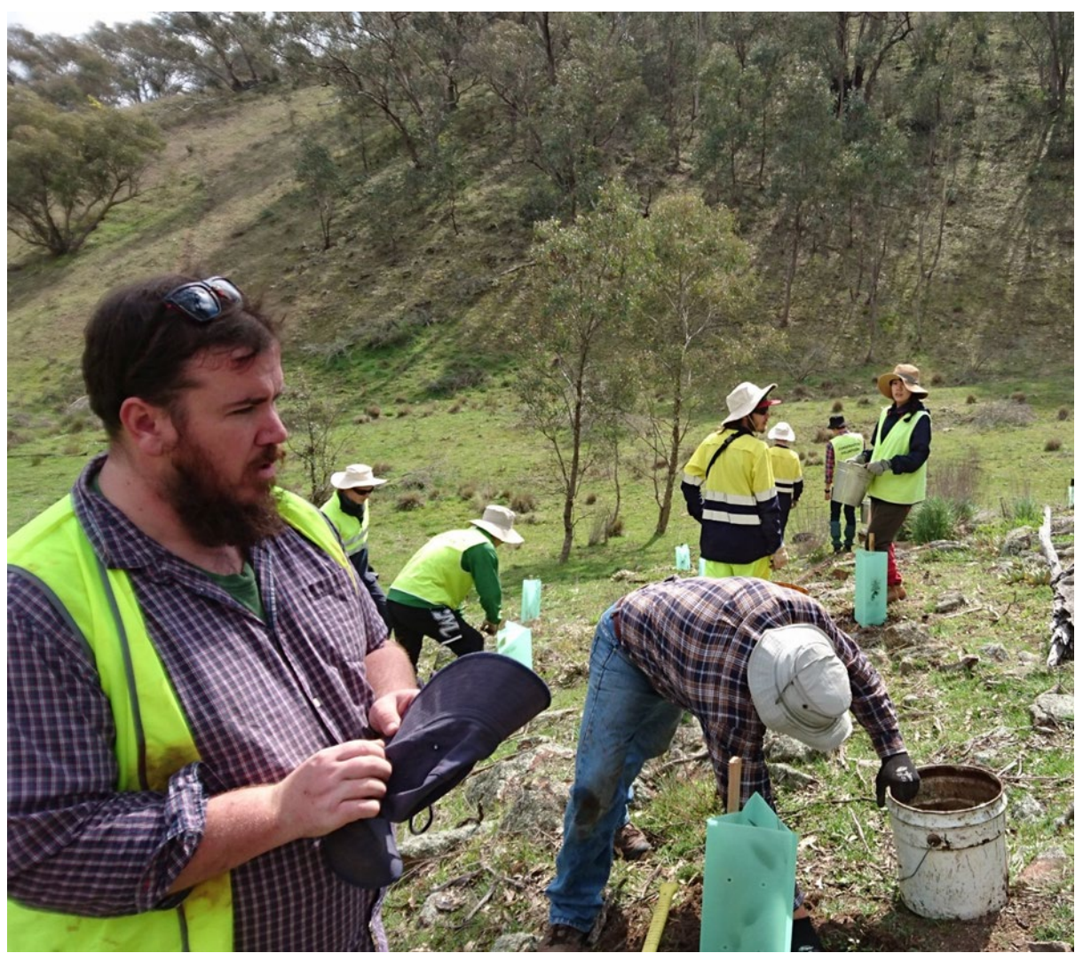
Photo 4 Volunteers at Wandiyali near Queanbeyan, planting trees on Threatened Species Day 2016 to provide habitat for woodland birds.

Hosting a threatened species event will not only contribute to statewide efforts as part of the NSW Government's Saving our Species program, but it is also a great way for your organisation to reach out to new audiences and reinvigorate the interest of your existing members.