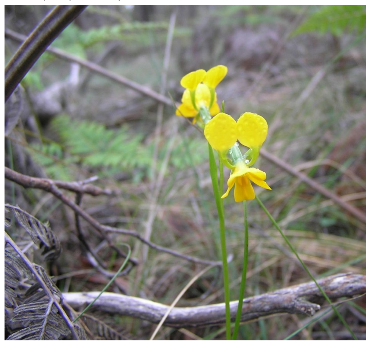
Photo 1 Buttercup doubletail ( Diuris aequalis ) – a threatened species of the southern tablelands.

We invite you to join us so together we can secure threatened species in New South Wales.