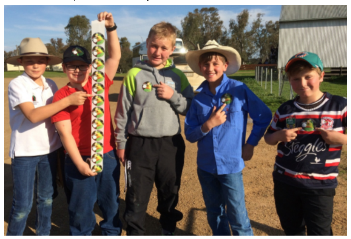
Photo 5 Boorowa's finest with their Superb parrot stickers.

You can choose from the list on the following page, or you can go to our website to help you find a threatened species to feature at your event.