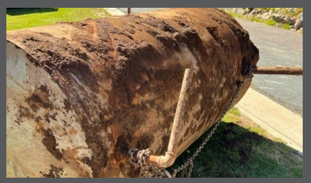
A decommissioned underground diesel tank.

Balancing the desire for warmth and comfort with the commitment to environmental stewardship is crucial in safeguarding the park's natural beauty. By choosing sustainable heating options and embracing responsible practices, lodge operators have continued to contribute to the preservation of this unique alpine wilderness, helping the Snowy Mountains to remain an awe-inspiring destination for generations to come.