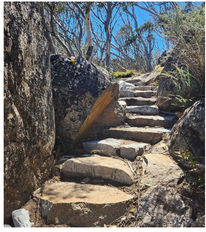
Rock steps on the Perisher to Bullocks Flat walk.

Most of the rock used for the paving and steps on the Snowies Alpine Walk has been sourced from a stockpile within Kosciuszko National Park, left over from the Snowy Scheme construction in the 1950s and 1960s.