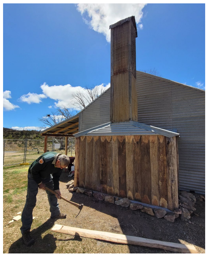
NPWS builder adzing chimney slabs on the recently rebuilt Bradley & O'Brien's Hut.

The rebuilding of Sawyers Rest House, Delany's, Vickery's, Bradley & O'Brien's and Brook's huts has been completed. These huts are the first of 11 historic huts damaged during the 2019-20 summer bushfires that will be rebuilt in Kosciuszko National Park huts by National Parks and Wildlife Service (NPWS) assisted by volunteers from the Kosciuszko Huts Association (KHA) and families associated with the huts.