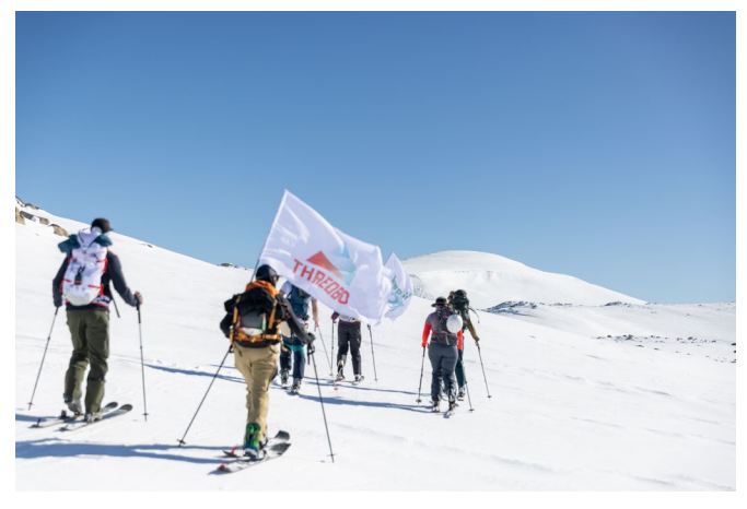
Ski touring to the top of Australia's highest peak.

With a packed schedule of events and communications, Environment Week kicked off on Monday 17 July with the annual "Tour to The Top"; a human-powered trip to the summit of Mt Kosciuszko (well, human-powered except for the initial chairlift ride which is powered by renewable electricity thanks to Thredbo's partnership with Red Energy). Throughout the bluebird touring day, the group of like-minded environmental enthusiasts discussed issues and ideas in the environment and sustainability scene.