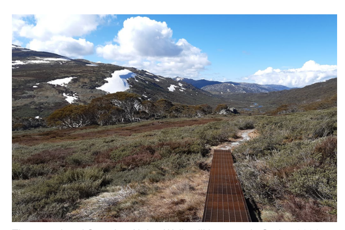
The completed Snowies Alpine Walk will be open in Spring 2024.

If you have any questions or want to update us on your plans, contact Kym Armstrong, <a href="mailto:kym.armstrong@environment.nsw.gov.au">kym.armstrong@environment.nsw.gov.au</a>