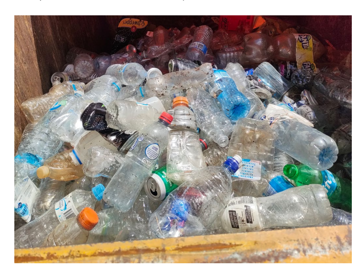
Plastic water bottles made up the bulk of the recyclable items collected.

A total weight of 973kg was collected on the day, made up of 807 kg landfill items and 66kg recycling, with an additional estimate of approximately 100kg of bulk waste items (including tables, boogie boards, poles, assorted scrap metal and rubber mats).