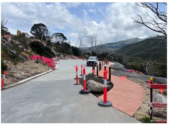
The new, almost complete, Illawong and Snowies Alpine Walk track head.