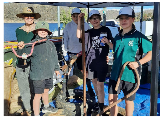
Local school children with some of the bulky items collected from the late foreshore.

This event is part of the Sustainable Snowies Litter Prevention Strategy, a NSW Environment Protection Authority Waste Less Recycle More Initiative, funded from the Waste Levy.