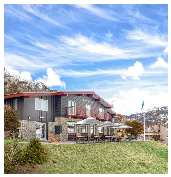
Guthega Inn.