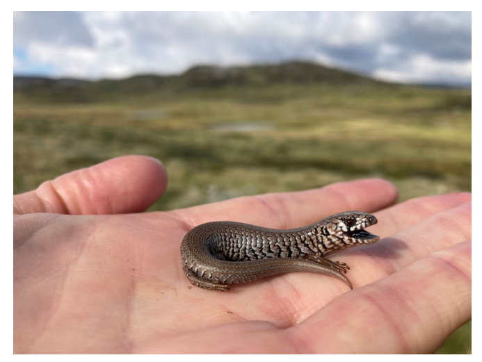
A juvenile alpine she-oak skink.

Visitors to Kosciuszko National Park routinely ski, cycle or walk through the habitats of these reptiles, unaware they are in the company of such interesting and unique animals being so small (with bodies no longer than 13cm) and often silent as they bask on rocks or scurry about under the cover of alpine heath plants. If you're lucky enough to spot a skink at high elevation before they dash back to shelter, chances are, you're in the presence of one of these incredible and threatened species, found nowhere else on Earth.