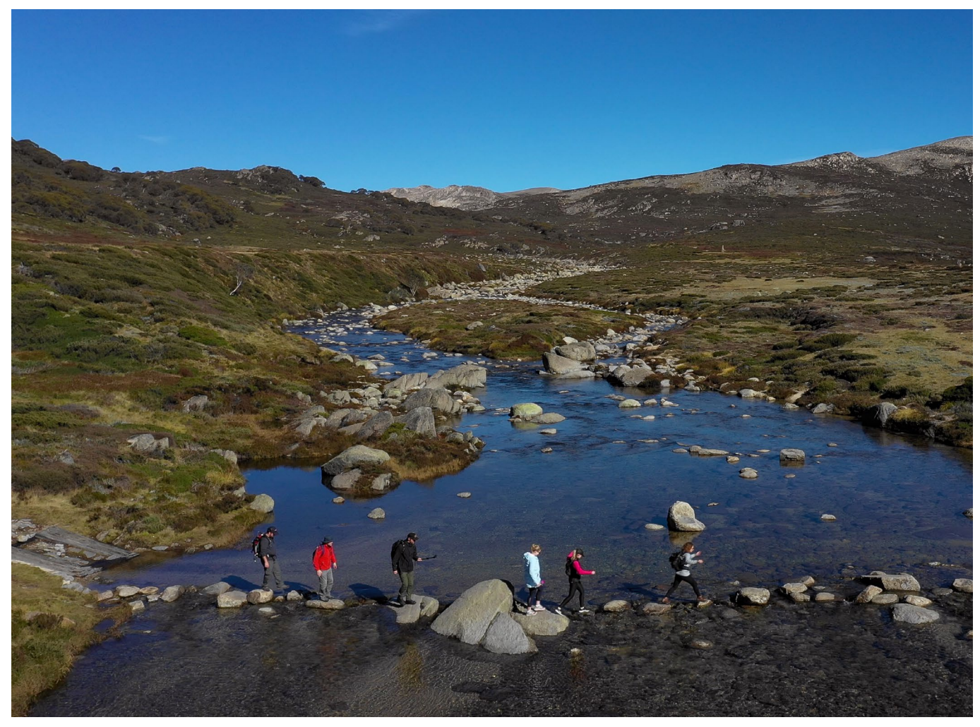
Rock hopping across the Snowy River is a wonderful way to start your summer hiking adventure up on the Main Range.

So, if you're in search of the perfect summer retreat where adventure meets relaxation, look no further than Stillwell Hotel at Charlotte Pass Snow Resort.