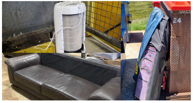
Examples of bulky waste incorrectly taken to the Waste Transfer Station in Perisher.

All bulky waste and hard rubbish must be taken to the Jindabyne Landfill for disposal.