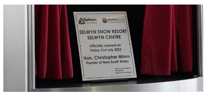
Unveiling of Selwyn Centre plaque.