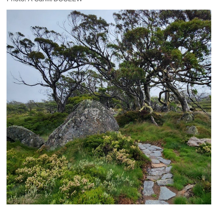
Rock paving on the Perisher to Bullocks Flat walk.