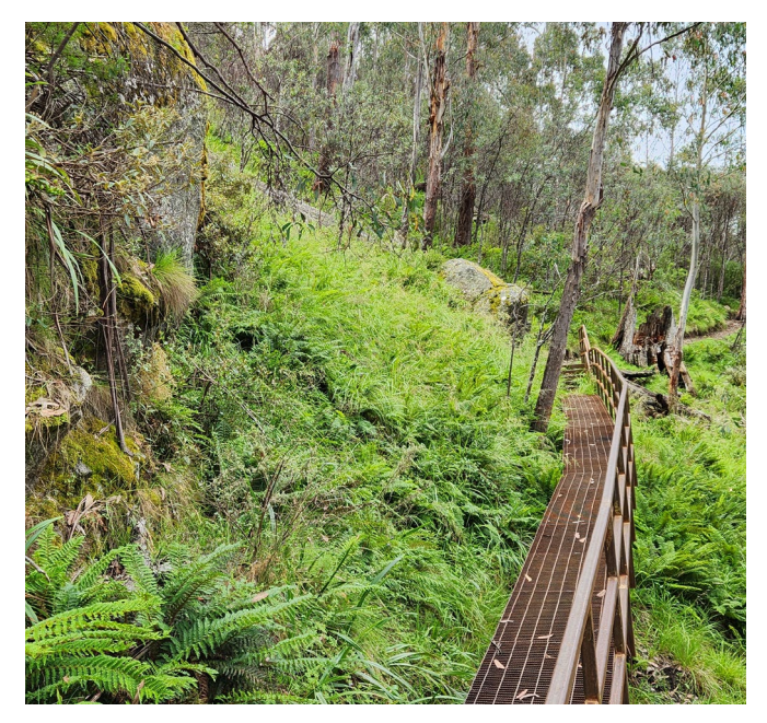
Perisher to Bullocks Flat Walk.

There's a lot of other work happening in the region so always check the <u>NSW National Parks and Wildlife</u> <u>Service (NPWS) alerts webpage</u> for the latest park closures and other important notifications. Things may also change day-to-day, especially as we undertake major upgrades to popular tracks such as the Mount Kosciuszko Summit walk so check in regularly to ensure you have the latest information.