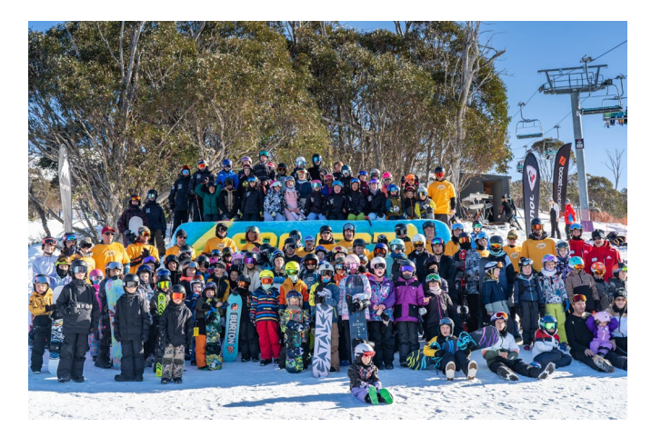
Australia's Best Ski Resort for Families.

With Kids Readers' Choice Awards for the sixth year in a row. Voted by Australian families, this win is a result of Thredbo's incredible family offering with its huge variety of snow terrain for all ages and abilities, Australia's only alpine gondola, one of the country's best snowsports schools, a dedicated beginner area and a massive line-up of family-friendly events.