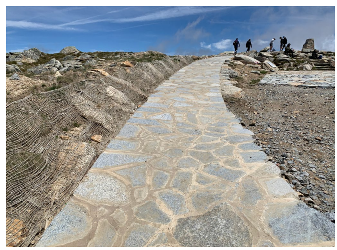
The new low mobility access ramp leading to the top of Mt Kosciuszko.

To ensure you are not disappointed when venturing out on these wonderful walks, please check the <u>Alerts page on the NPWS website</u> for any track closures or delays while works are occurring.