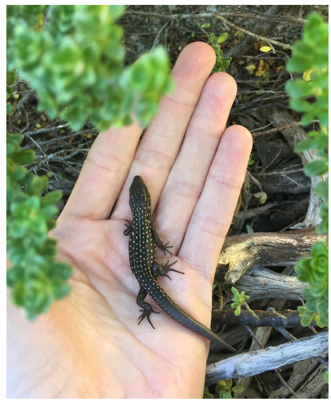
A newborn Guthega skink.

For more information visit www.environment.nsw.gov.au/sos/skinks