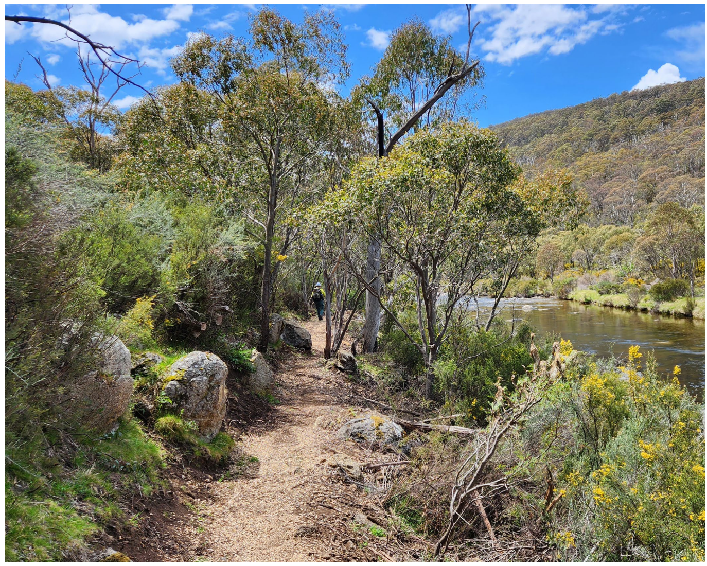
Perisher to Bullocks Flat Walk along the Thredbo River.

Stage 4 of the Snowies Alpine Walk will form part of the world class 55 km multi-day walk experience. The construction of Stage 4 includes 11.4 km of new walking track, upgrades to car parking facilities and signage. The final stage will complement the first 3 stages in connecting the villages of Thredbo, Charlotte Pass, Guthega, Perisher and Bullocks Flat and will enhance tourism in the region.