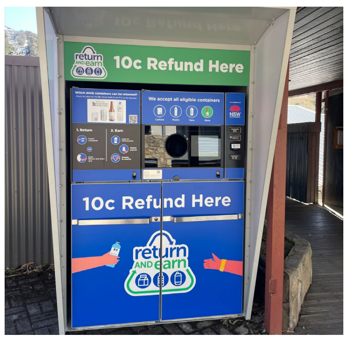
Turn empty drink bottles into cash at Thredbo's Return and Earn.

For comprehensive information regarding Return and Earn, be sure to visit <a href="https://www.returnandearn.org.au">www.returnandearn.org.au</a>.