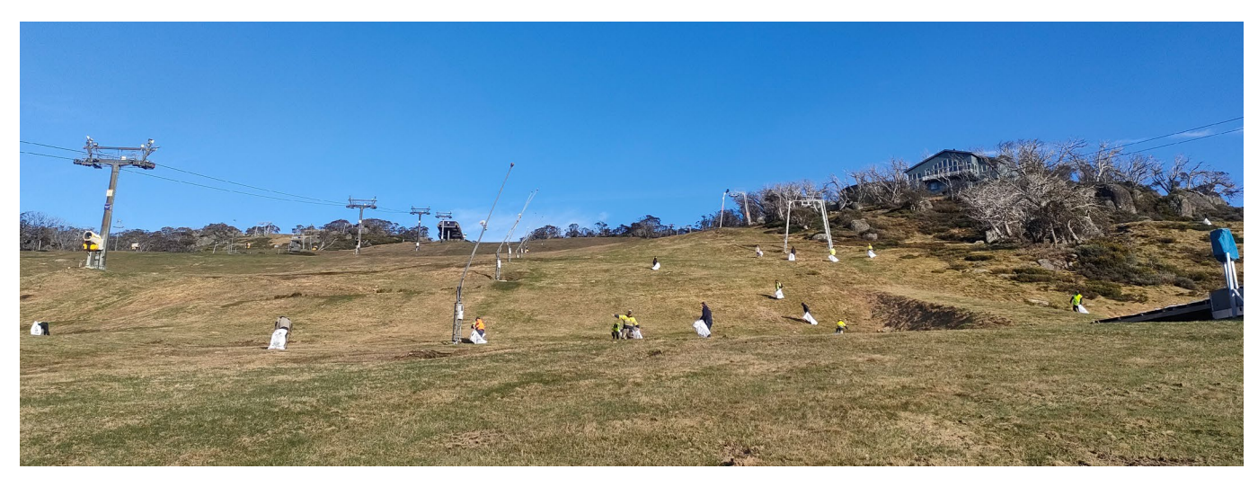
Perisher staff collect litter from Front Valley.

Perisher staff joined together with the National Parks and Wildlife Services team in October to pick up litter from numerous locations around Australia's largest ski resort, including Perisher Valley, Blue Cow, Smiggin Holes, Bullocks Flat, as well as at The Station in Jindabyne. The clean-up day happens annually following a busy ski season.