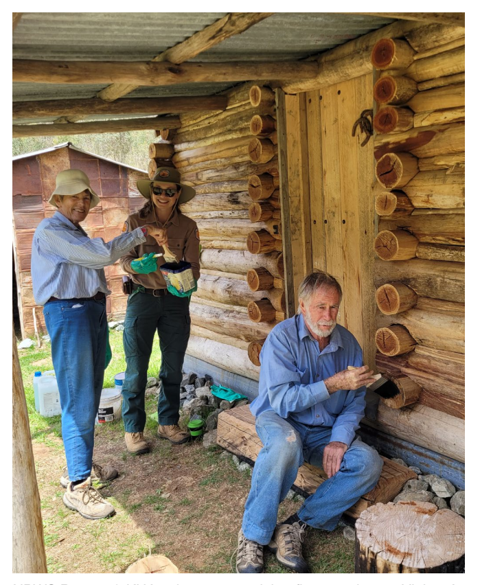
NPWS Ranger & KHA volunteers applying fire retardant to Vickery's Hut #2.

Descendants and others with photographs and other historic records of these huts, or those interested in volunteering to help rebuild these huts, are encouraged to contact NPWS by emailing <a href="mailto:srhutsrebuild@environment.">srhutsrebuild@environment.</a> nsw.gov.au or calling 02 6947 7000.