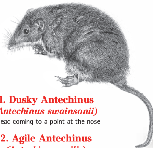
1. Dusky Antechinus ( Antechinus swainsonii )