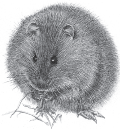
#Broad-toothed Rat ( Mastacomys fuscus )