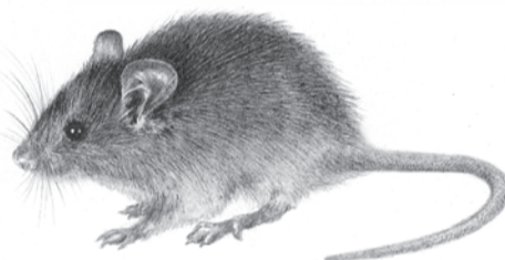
*House Mouse ( Mus musculus )