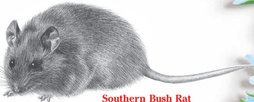
Southern Bush Rat ( Rattus fuscipes )