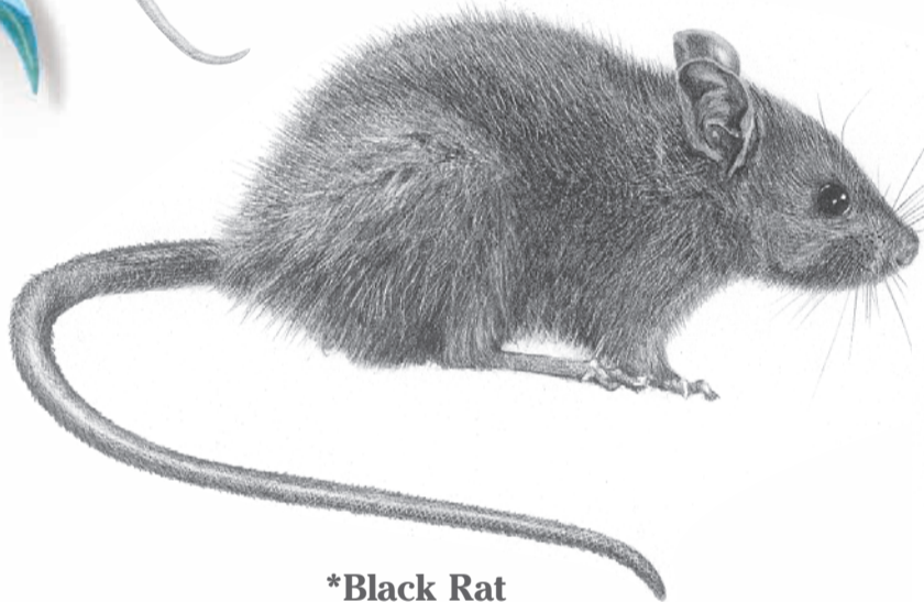
*Black Rat ( Rattus rattus )