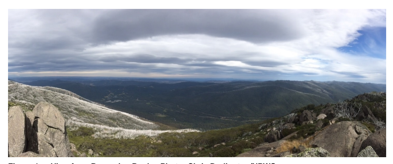
Figure 1 View from Porcupine Rocks.

The strategy also highlights the opportunity to improve access for people with disabilities and mobility restrictions. There are currently very few all-access tracks in KNP and this restricts many people from being able to venture far from their vehicles.