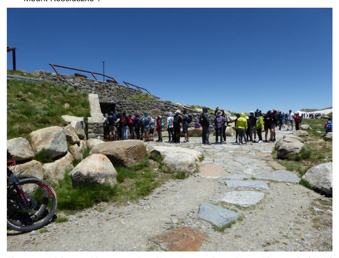
Figure 3 Visitors waiting to use the toilet at Rawson Pass.