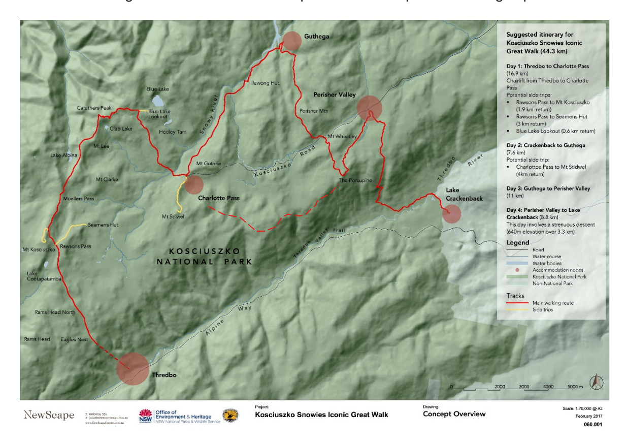
Figure 4 Potential locations of new tracks to create the iconic multiday walk.

If a track from Charlotte Pass to Perisher Gap (via Guthega) is deemed not feasible following an environmental assessment, an alternative route along the Ramshead Range from Charlotte Pass Village to Porcupine rock would be a suitable alternative. An initial assessment suggests there are few threatened species or threatened ecological communities along this route and would still provide an exceptional walking experience.