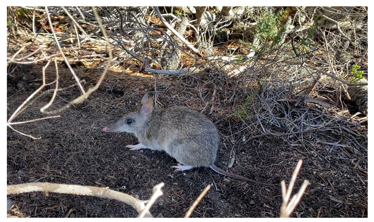
Long-nosed bandicoot at Quarantine Station.