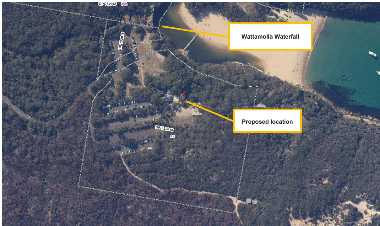
Figure 1 Location of the activity