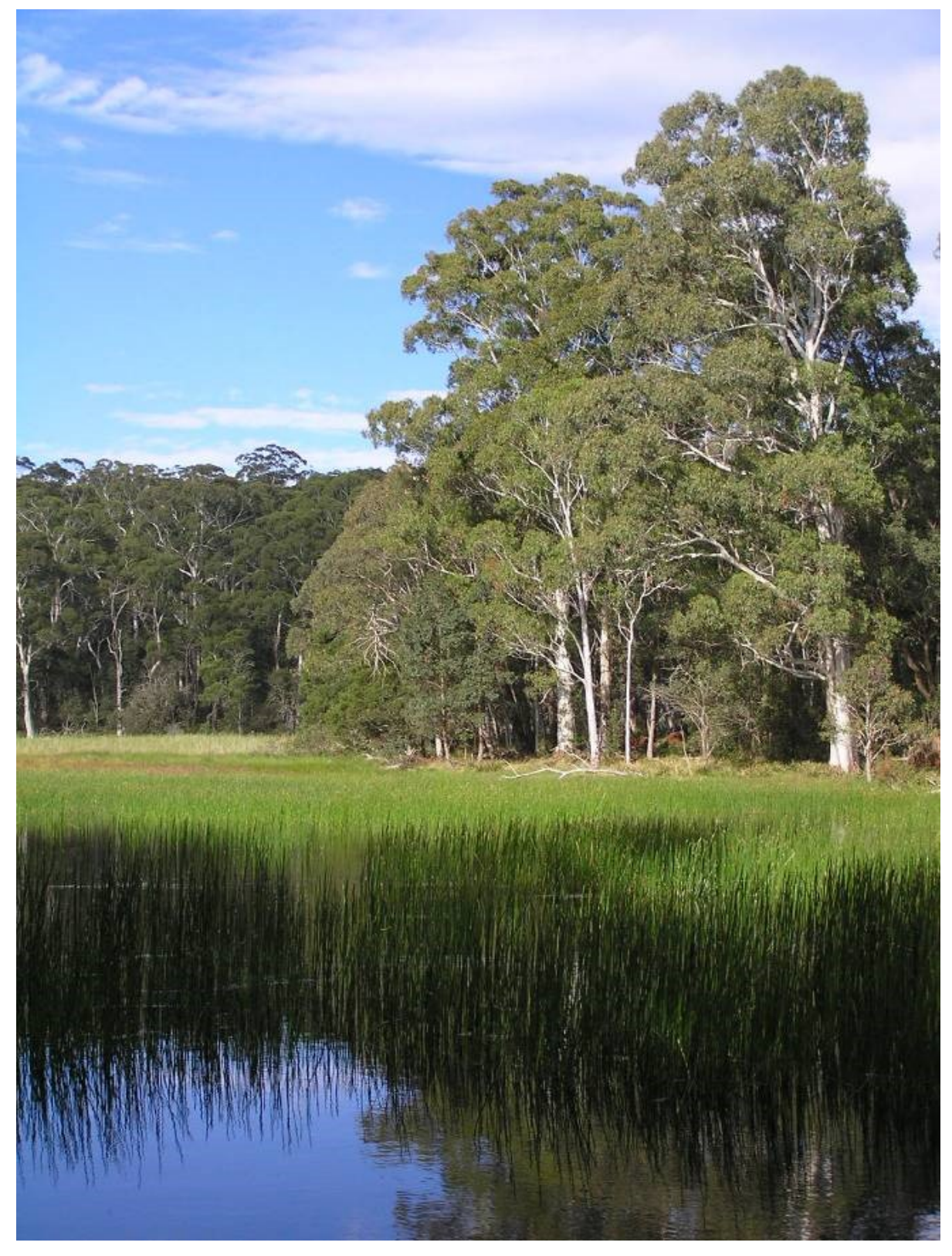
Figure 3 View from New Country Swamp Day Use and Camping Area.