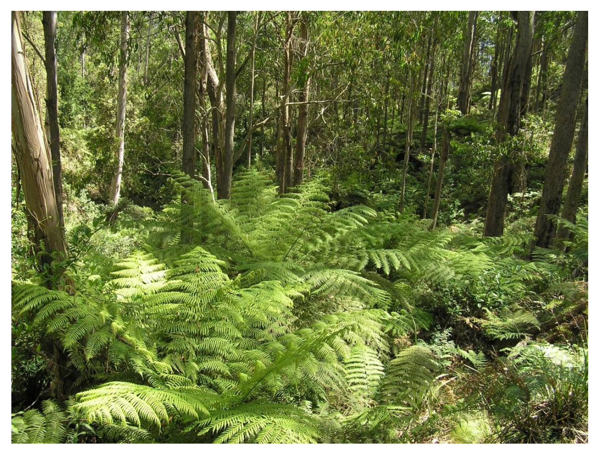
Figure 2 A typical moist forest ecosystem of Mummel Gulf NP.

The mosaic of high elevation moist and dry open forest ecosystems supports varied flora. There is potential habitat for other significant plant species, including the vulnerable herb Euphrasia ciliolata and the endangered liana Cynanchum elegans .