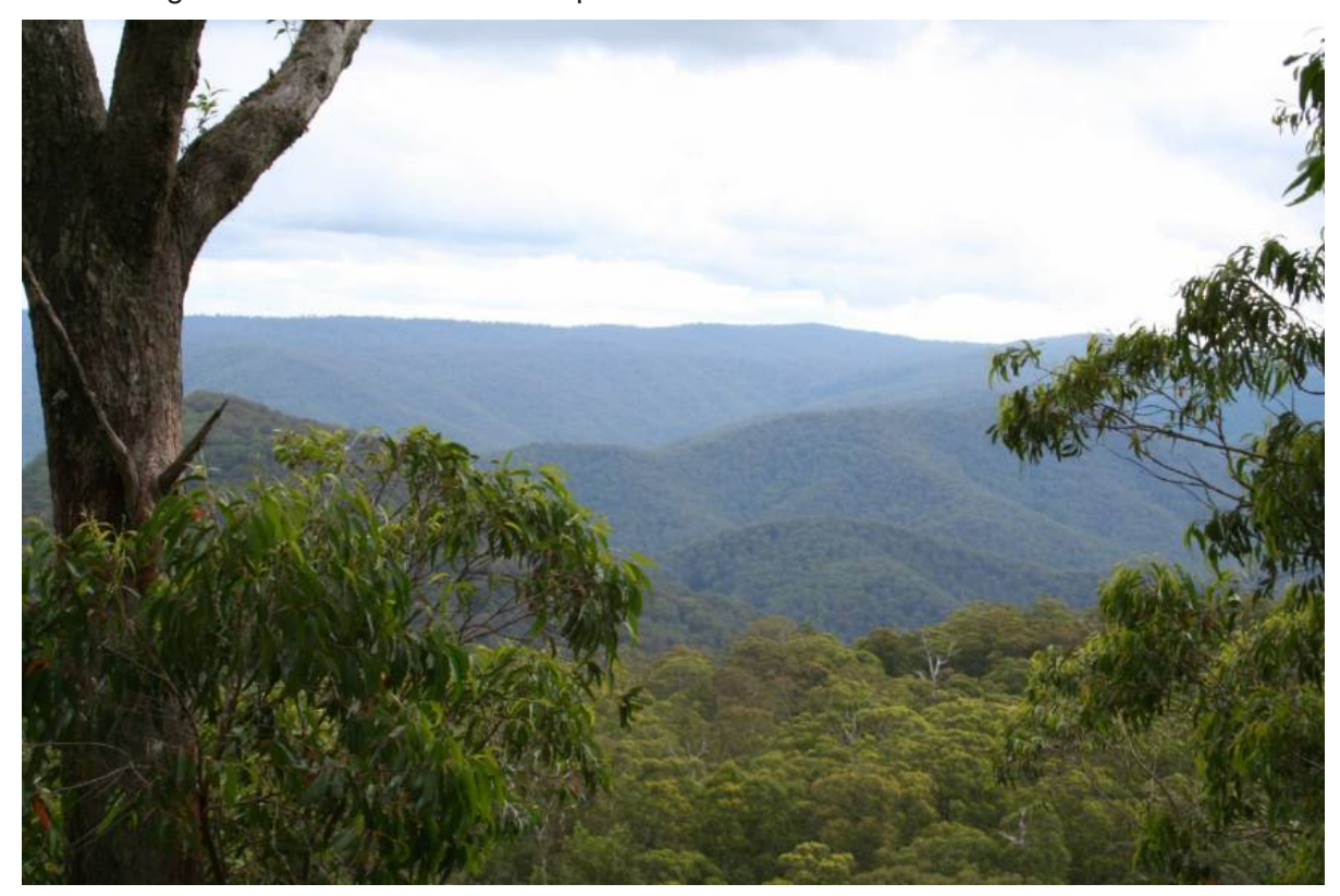
Figure 1 Part of the central catchment of the Mummel River.

The Mummel River, which has formed a deep V-shaped gorge, or gulf, between high ridges, runs through the middle of the national park.