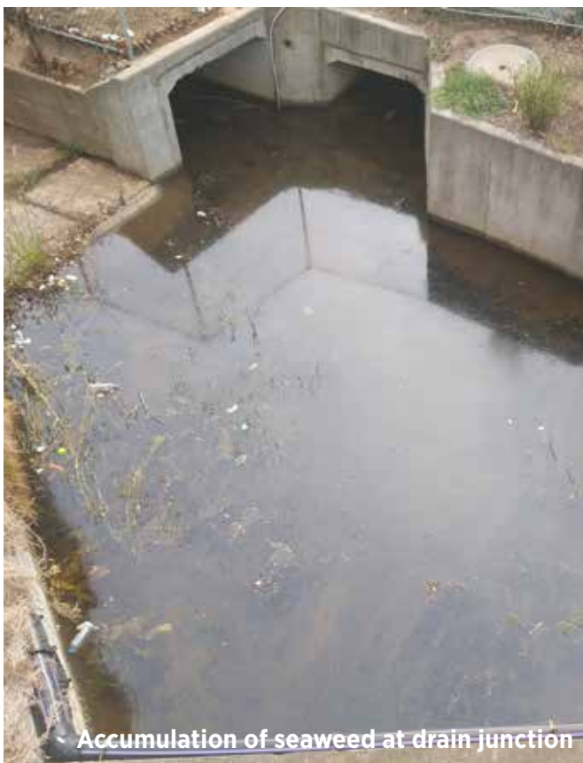
Accumulation of seaweed at drain junction

The NSW Government with the Central Coast Council launched a community-wide engagement program in December 2019 to share information with the community, seek local knowledge on potential contamination sources and communicate the progress of investigations and remediation.